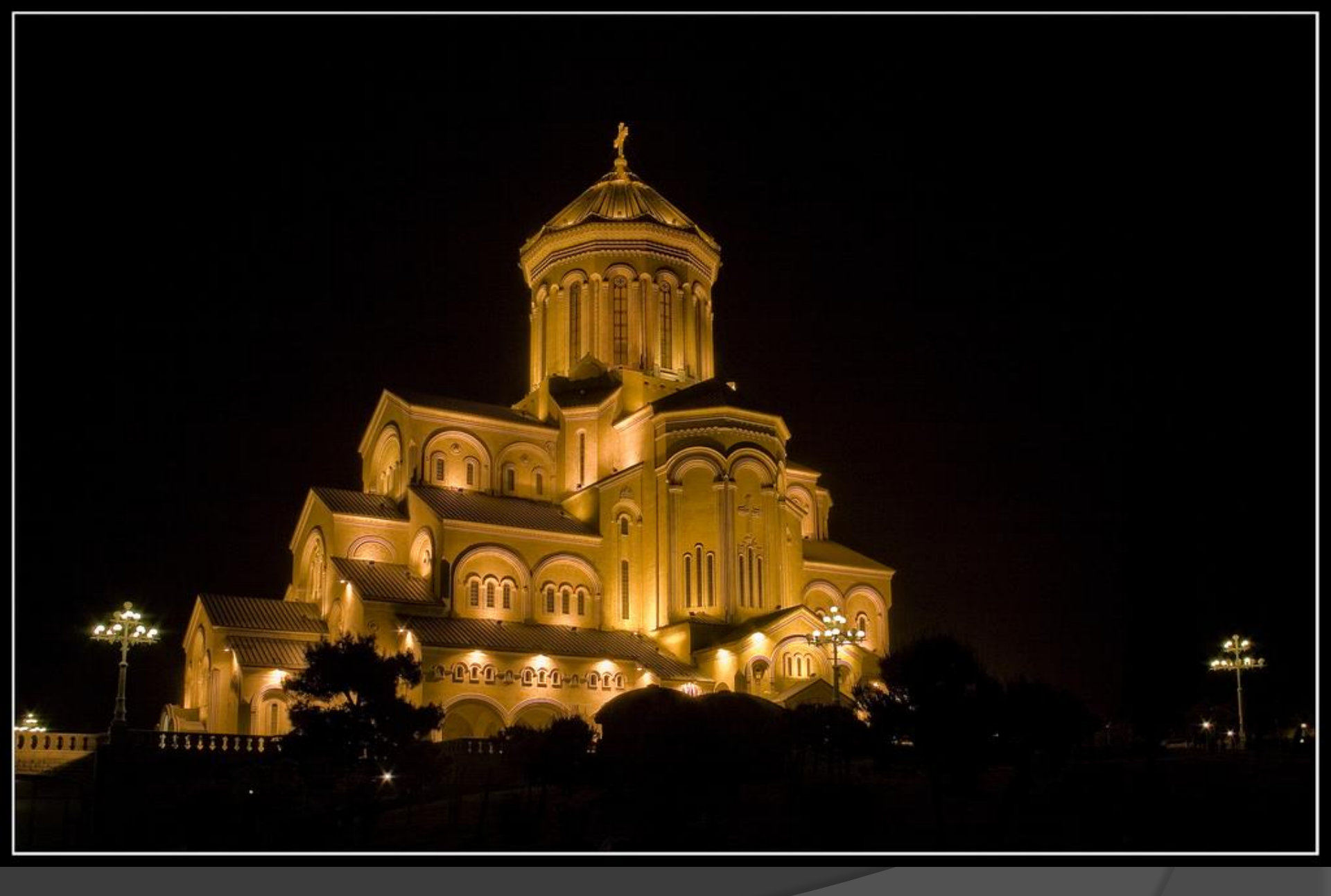
Tbilisi Sameba Cathedral